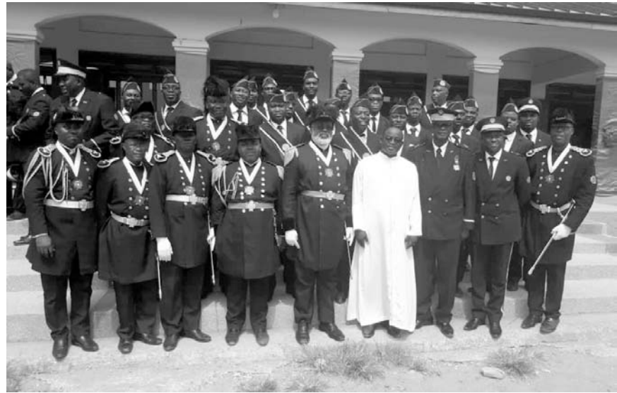
The Grand President, supporting officers and the new members