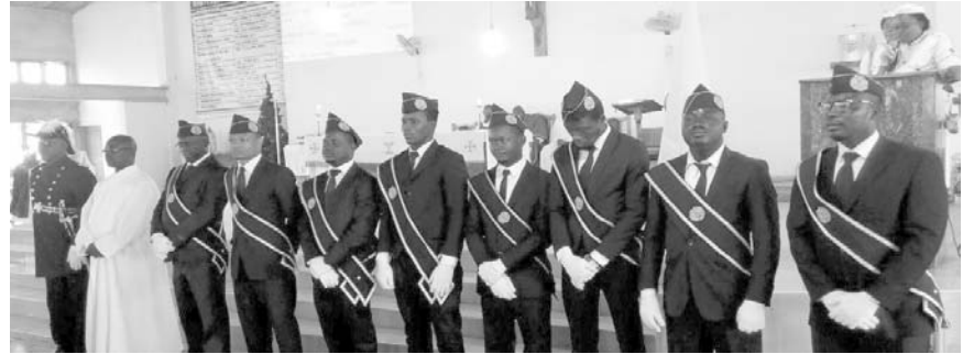
Officers of St. Patrick Commandery being introduced to parishners.