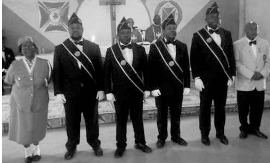
The Emeonalo cadets now KSJI Knights.

Highlight at the initiation was the manifestation of KSJI as a family