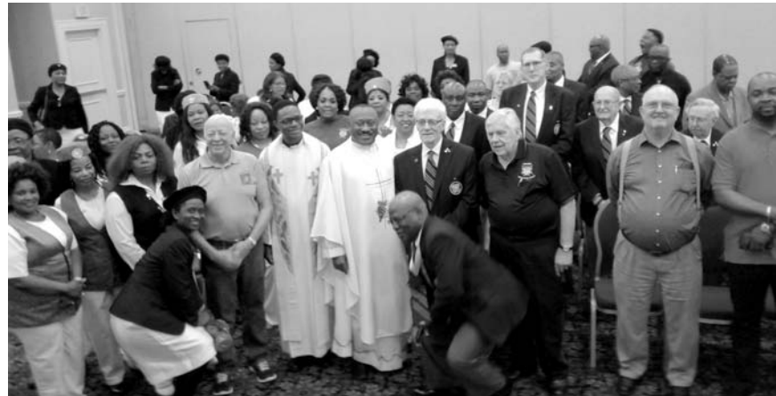
Conventioneers after the Memorial Mass.