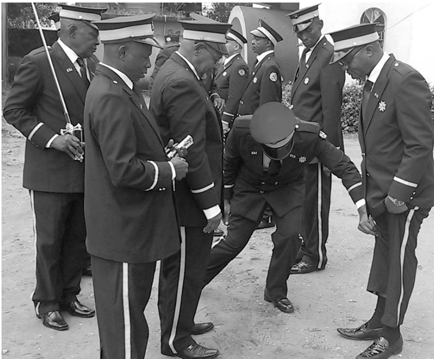
The Grand inspecting members of Commandery #613